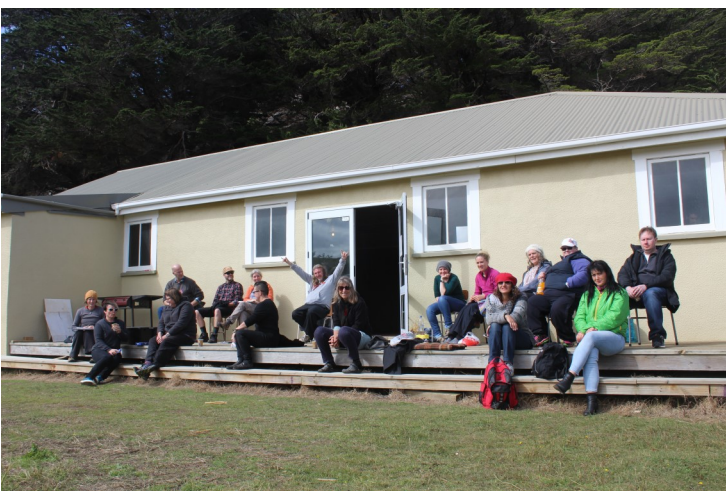
Above are some pictures from our trip to Hooper's Inlet and Allans Beach on the Otago Peninsula; Sea Lion's, BBQ, sketching and beautiful surrounds, what a great day out!

Privacy Creatures. Artsenta has been asked by the privacy commissioner, to submit 5 works to help promote privacy week which runs from 9th - 14th of May. The theme for the project is 'Privacy Creatures', and will involve other creative spaces from around New Zealand. The images will be displayed on the privacy commissions website http://privacy.org.nz/ as well as their social media channels.